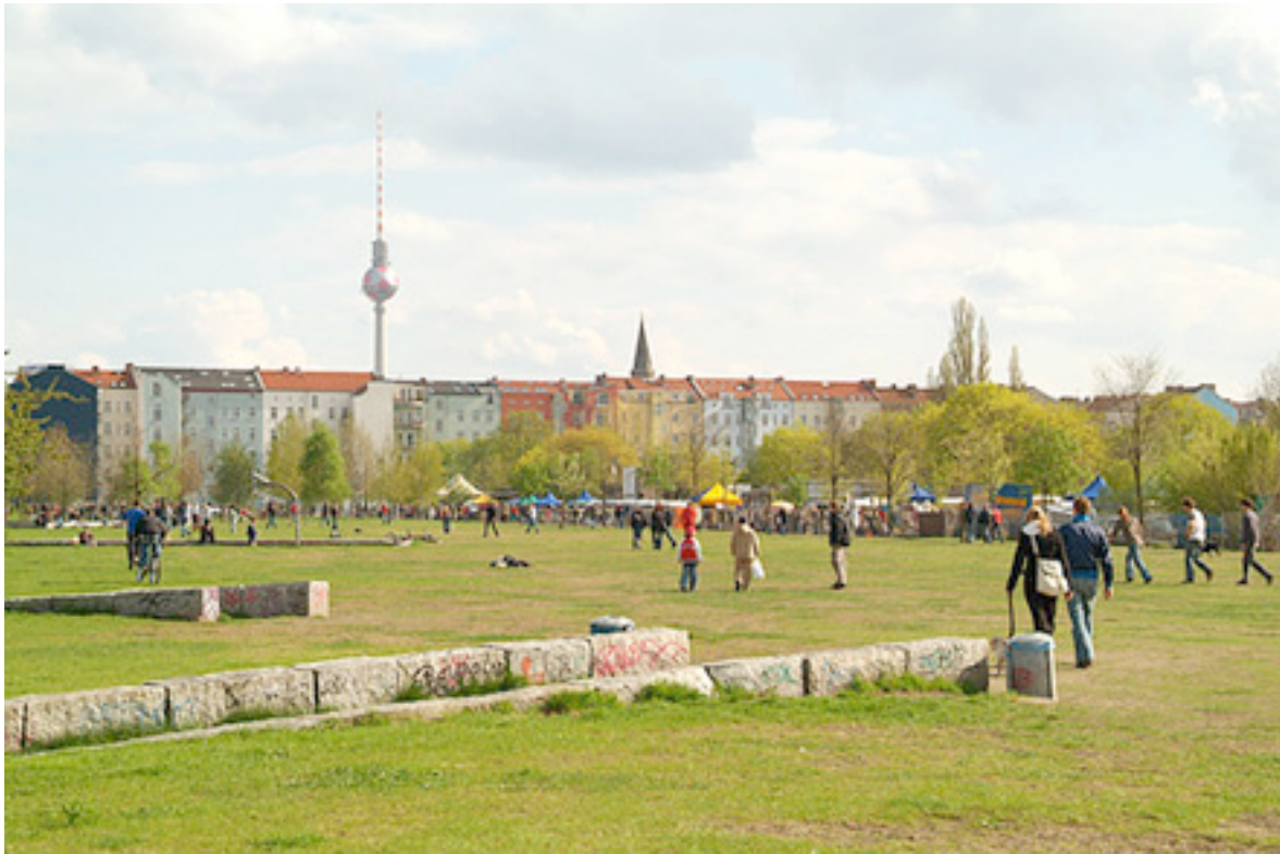
View of Sunday Karaoke and Flea Market: